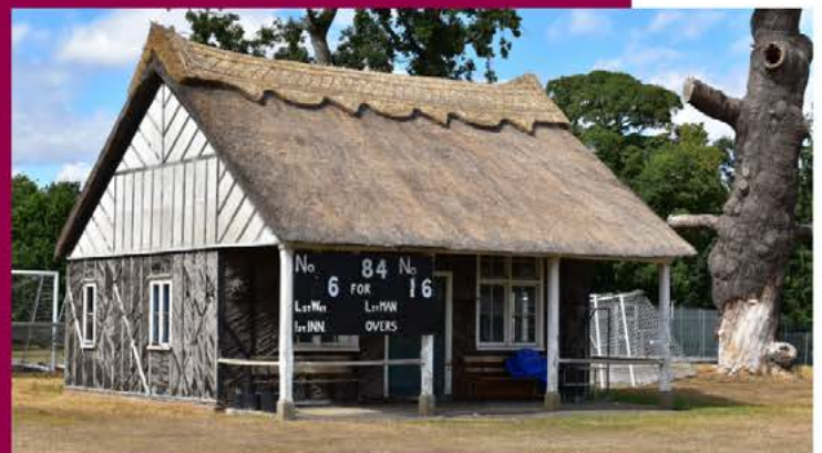
PRESENT: THE NEW THATCH WAS COMPLETED IN SUMMER 2022