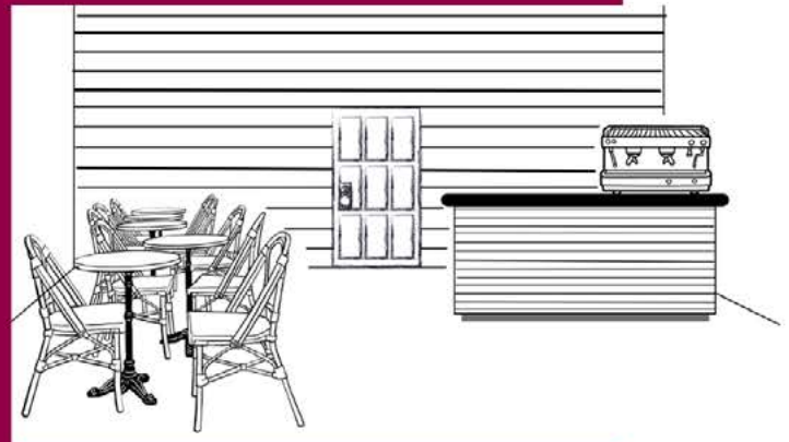
FUTURE: WITH YOUR SUPPORT THE PAVILION WILL BECOME A PLACE FOR SPORTS TEAS AND REFRESHMENTS FOR OUR SCHOOL.