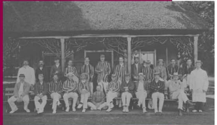
PAST: THIS PHOTO FROM 1901 FEATURES AN ENGLAND 11 WHO PLAYED WOOLVERSTONE PARK CRICKET CLUB.

We very much want our restored pavilion to be a fundamental part of our school for many more generations to come.