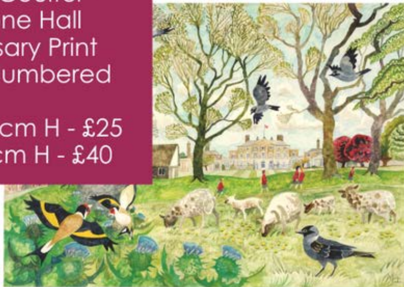
IPSWICH HIGH SCHOOL for GIRLS, WOOLVERSTONE Reproduced from an original watercolour by Michael Coulter in celebration of the 20th anniversary of the school's move to Woolverstone Hall.

43cm W x 32.5cm H - £25 57cm W x 43cm H - £40